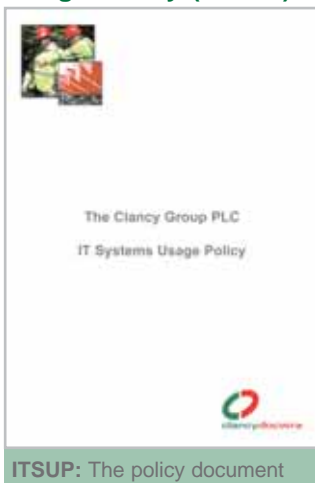
ITSUP: The policy document

Answer: The I.T. Systems Usage Policy (ITSUP) is a fundamental element of the organisation's I.T. Policy Statement, available on the Business Management System.