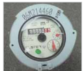
OnTrack: A picture speaks a thousand words