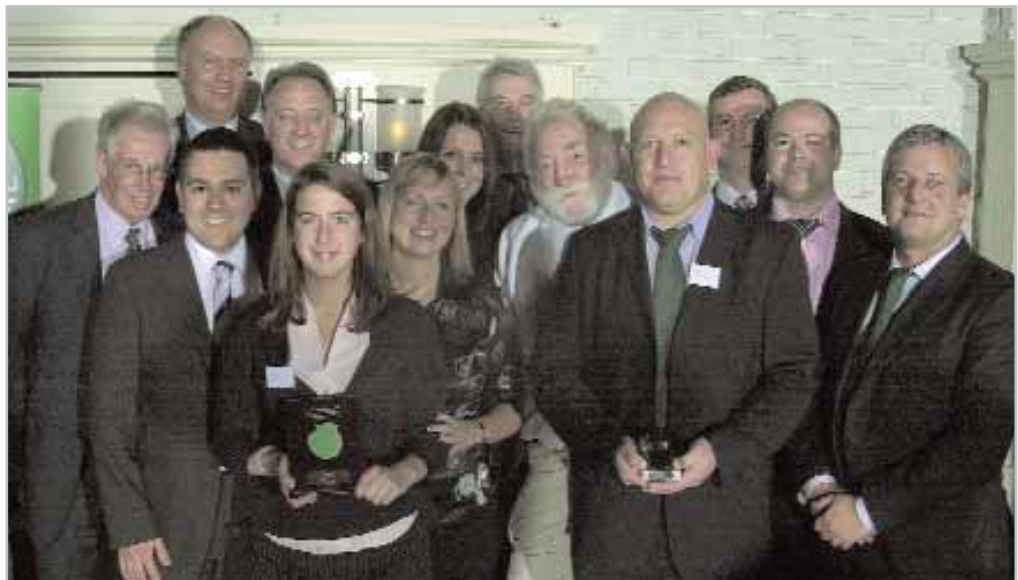
Green Apple: The winning team

represent significant achievements by these contracts and highlight the continuing commitment that the business has to environmental issues.