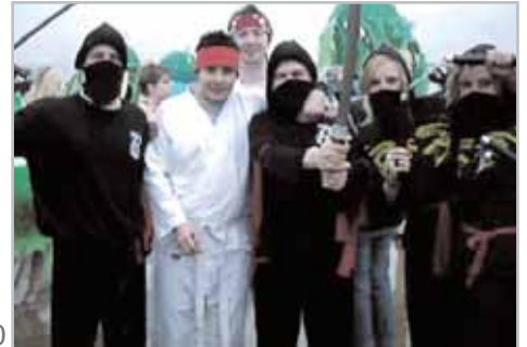
The Dippers: Members of the team