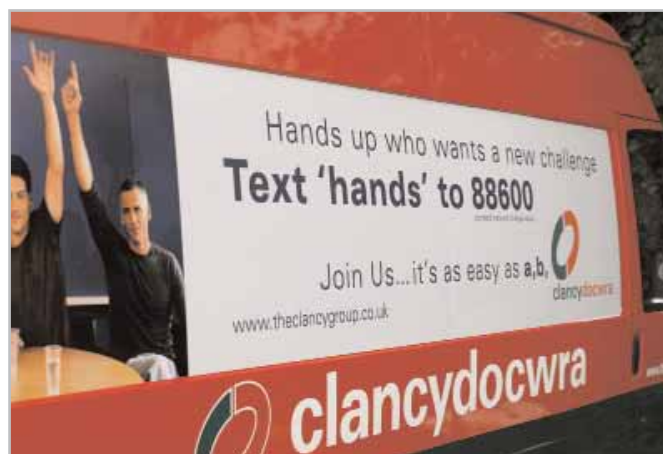
Hands Up: The side panel advert.

It is still too early to give accurate figures on the success of the campaign but we do know that around six hundred people have seen it and responded to the text number on the advert.