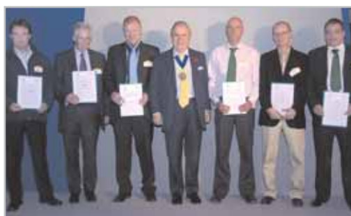
Seven miles of water mains and associated services have so far been replaced in the City.