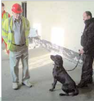
Busted: The dogs pick out the smugglers by sitting down in front of the offender

The Clancy Docwra team also participated in a training exercise with the Dog Handlers Training Unit (pictured) to identify those persons who may be carrying illegal substances. Training is often carried out on objects, such as chairs, in which drugs are hidden.